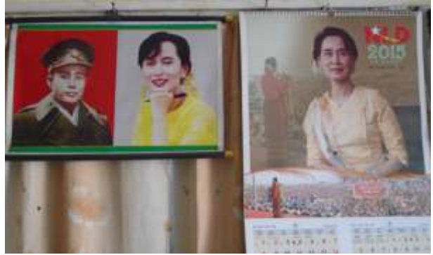
dictatorship and was released in 2011, after 15 years of captivity. She is very popular in Myanmar.

Aung San Suu Kyi has been kept under house arrest (locked in her house) during the military