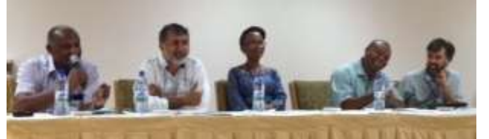
Photo: Delegates from Sudan, South Africa, Botswana, Uganda and Mali describing facilitators

In countries all around the world, the message is getting through about the importance of primary care and family medicine in ensuring universal access to health care and equitable health outcomes. Nowhere is this as important as in Africa. Compared to the rest of the world, health care in Africa is characterized by a huge discrepancy between the high burden of disease and the scarcity of health care workers, particularly doctors. Low-income countries in Sub-Saharan Africa face enormous challenges including high rates of infant and maternal mortality, HIV/AIDS, TB-infection, endemic malaria, non- communicable diseases, violence, trauma and pervasive poverty.